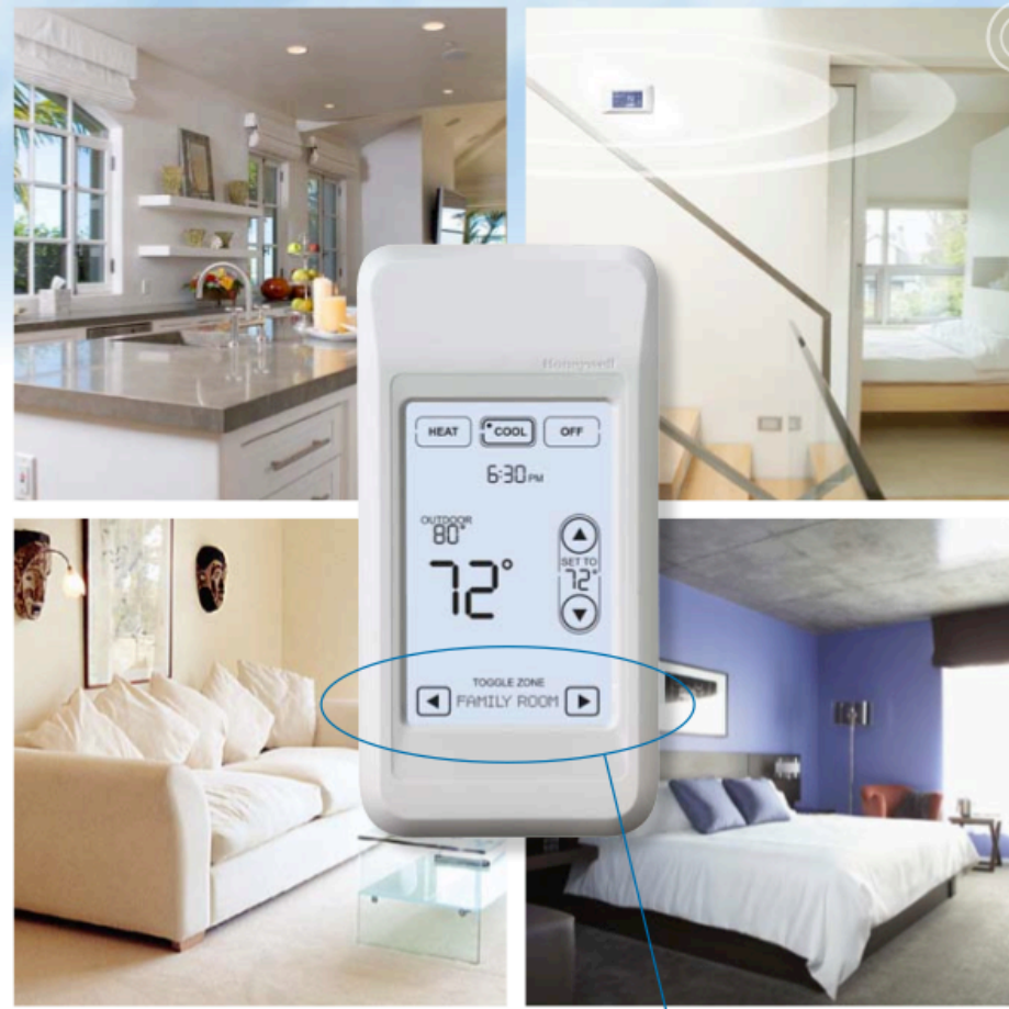
Toggle between zones to set the temperature in any zone from anywhere in the home.

The Portable Comfort Control also maintains the schedule from your programmable thermostat. Easily adjust the temperature setting before bedtime to set-back for energy savings after you fall asleep — or turn the system off for easy overnight energy savings.