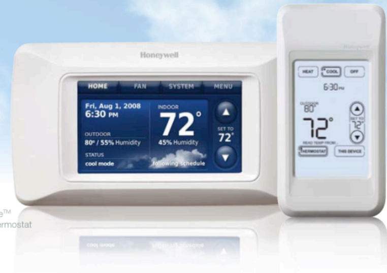
Prestige™ HD Thermostat